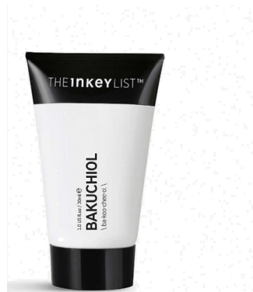
Selfridges 30ml Moisturiser - £12.99