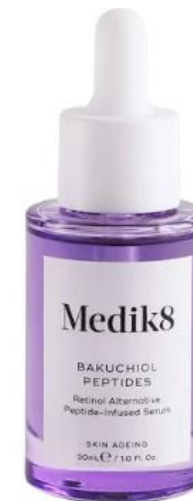
Herbivore Medik8 (Space NK) 30ml Skin serum - £49