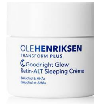
Ole Henriksen 50ml Sleeping Crème - £51