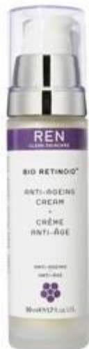
REN 50ml anti-ageing Moisturiser - £52