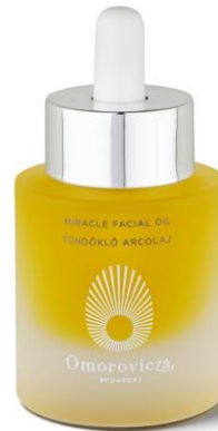
Harrods 30ml Facial Oil - £90