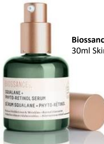
Biossance 30ml Skin serum - £74