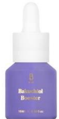
BYBI 15ml skin booster - £13